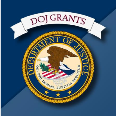
Department of Justice