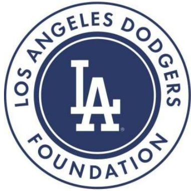
Los Angeles Dodgers Foundation