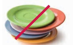
Dishes & Mirrors