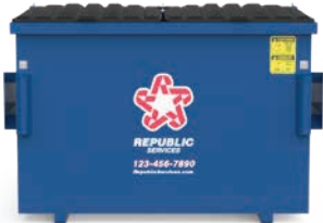
4-yard dumpster (72" L x 54" W x 48" H)