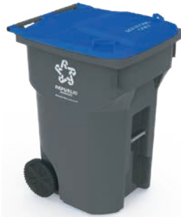
96-gallon 40.7" H x 28" W x 32.1" D Holds ten 13-gallon trash bags

The standard cart size is 96 gallons . Smaller carts are available in 35-gallon and 64-gallon sizes. Rates do not vary based on cart size.