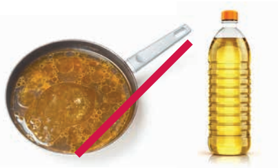
Fats, Oils & Grease