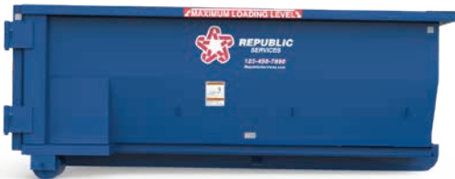
10-yard roll-off (12'8" L x 8'3" W x 4'4" H)