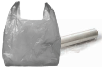
Plastic Bags & Wrap