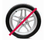
Tires & Auto Parts