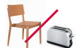
Furniture & Appliances