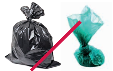
Trash & Pet Waste