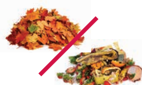
Yard & Food Waste