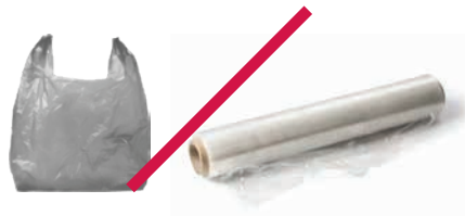
Plastic Bags & Wrap