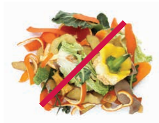
Yard & Food Waste