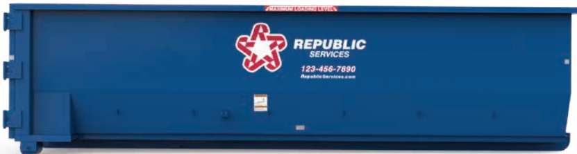
30-yard roll-off (23'1" L x 8' W x 6'1" H)