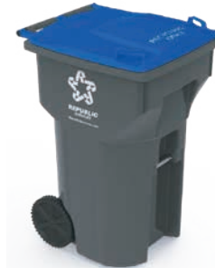
64-gallon 39.1" H x 24.4" W x 27.5" D Holds six 13-gallon trash bags