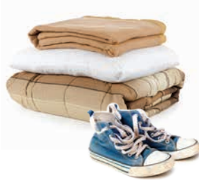
Clothing & Bedding