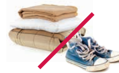
Clothing & Bedding