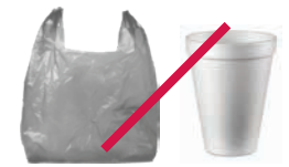
Plastic Bags & Styrofoam®