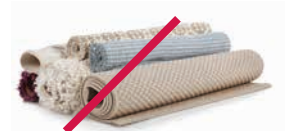
Carpet & Rugs