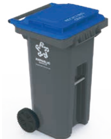
35-gallon 36" H x 19.7" W x 26.3" D Holds three 13-gallon trash bags

(Containers shown are for size reference only; not for color)