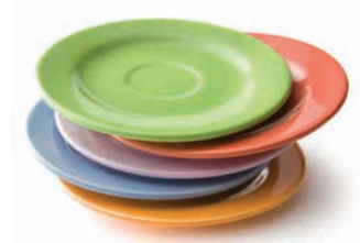
Dishes & Mirrors