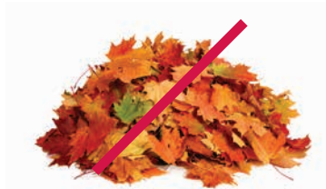
Yard & Food Waste